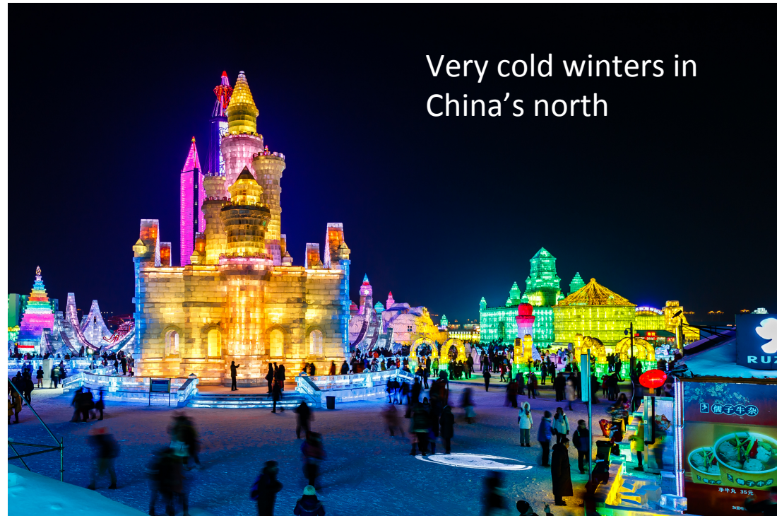
Harbin, China – Carved ice buildings at the International Ice and Snow Festival

China is a vast land spanning many degrees of latitude. It also has a very complicated terrain. As a result, China has a variety of temperature and rainfall zones. Winter in most areas are cold and dry. Summers are generally hot and rainy.